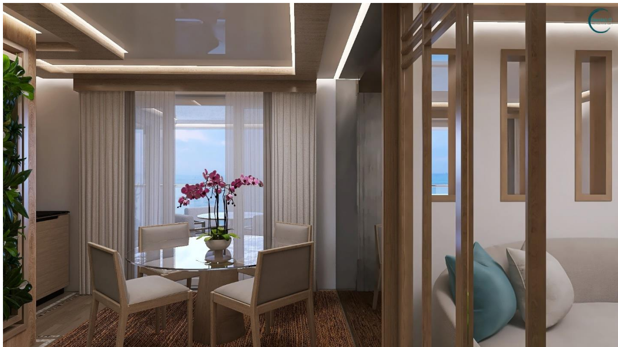
A preview of the sustainable suite design for the Sustainable Passenger Yachts.